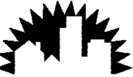
EXHIBIT SPACE APPLICATION & CONTRACT